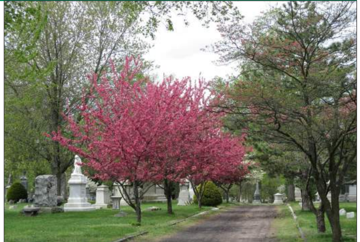
Historic walks in quiet contemplation.