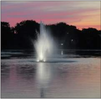
The pond at sunset.

Evergreen Cemetery Association of New Haven & Crematory 769 Ella T. Grasso Blvd. New Haven CT 06519