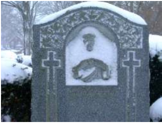
Snow on a monument

Evergreen Cemetery Association of New Haven & Crematory 769 Ella T. Grasso Blvd. New Haven CT 06519